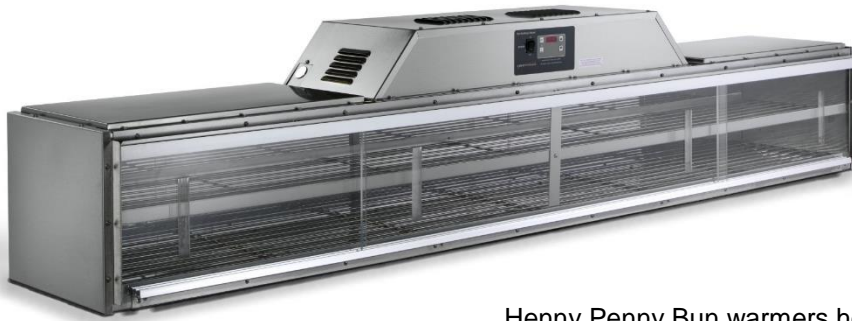
BW 8 bun warmer with 2 shelves, 8 trays across

Henny Penny Bun warmers help maintain higher bun quality and texture while improving the efficiency of sandwich production.