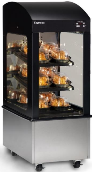
EPC 200 express profit center 2-ft unit on standard casters

Henny Penny express profit centers present an excellent solution for retailers seeking to expand hot food impulse sales and cross-merchandising opportunities.