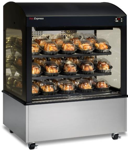
EPC 400 Express profit center short profile 4-ft unit on available casters

Henny Penny express profit centers present an excellent solution for retailers seeking to expand hot food impulse sales and cross-merchandising opportunities.