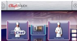
Chef's Touch control: Just tap and swipe to run built-in apps

Henny Penny FlexFusion combi ovens combine different cooking methods into one piece of equipment with the flexibility to cook nearly everything on your menu to perfection. The FlexFusion Team combi offers the versatility of two separate cabinets in one integrated platform. Each cooking chamber utilizes a powerful boilerless steam generation system that instantly adds or eliminates the precise amount of moisture needed to maintain desired cooking conditions... all while saving more energy and water than ever through an improved heat exchange design. The FlexFusion Team combi Platinum Series features two independent Chef'sTouch control systems on one convenient eye-