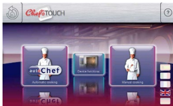
Chef'sTouch control: Just tap and swipe to run automated cooking and operating apps

The Platinum Series features Chef'sTouch, an intuitive control system with a durable 7-inch touch/swipe screen that makes cooking with FlexFusion as easy as using a smart phone!