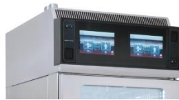
Available without integrated hood as FSD 610/610

Each cooking chamber utilizes a powerful boilerless steam generation system that instantly adds or eliminates the precise amount of moisture needed to maintain desired cooking conditions... all while saving more energy and water through an