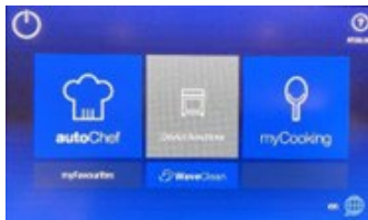
Chef's Touch control with Smokelnside app: Just tap and swipe to add smoke to any recipe!

The FPE 615 combi smoker incorporates all the standard features of FlexFusion Platinum Series FlexiRack 6-pan combi ovens, including multi-sensor temperature probe and USB port (see FPE 615 data sheet for more information.)