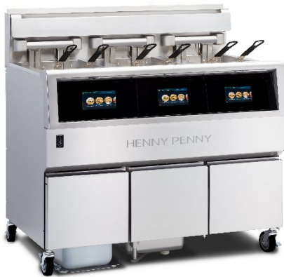
OFE 513 3-well open fryer

The Henny Penny F5 open fryer is designed from the ground up to make frying high-quality food easier, safer and more efficient for any kitchen.