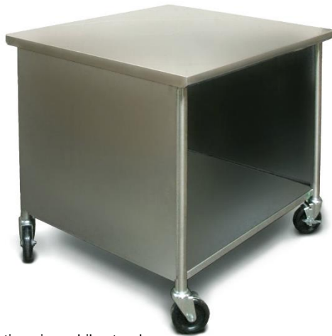
SCT 800 rotisserie mobile stand

This sturdy mobile work stand is designed specifically as a base for mounting the Henny Penny SCR 6 or SCR 8 countertop rotisseries when built-in countertops are not available.