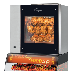
Space Saver with TDR5 M