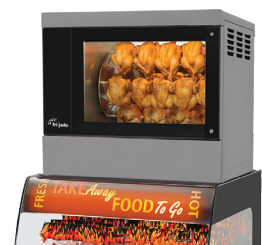
Space Saver with TG 4