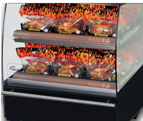
MD 86-2 self serve heated merchandiser

* see separate spec sheets for more information on the 4- and 5-spit rotisseries