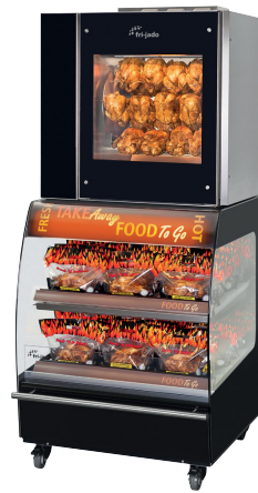
Space Saver with TDR5 P

The Fri-Jado Space Saver is a prime example of effective use of floor space. By combining a TDR 5 or TG4 rotisserie and a MDS 86-2 Self-Serve grab-and-go merchandiser, you save valuable floor space.