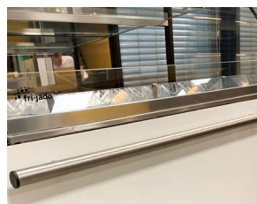
Accessories - Bumper