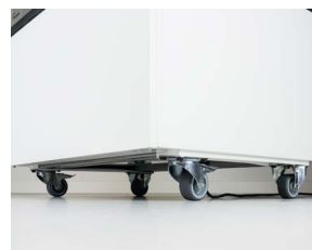
Accessories - Caster set