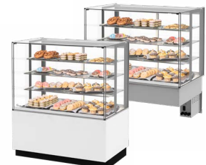
Models on underframe or drop-in version