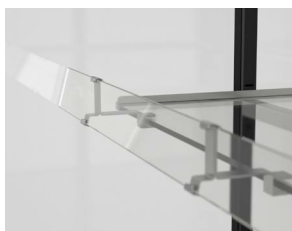
Fixing system for price rails